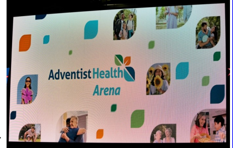
Newly named Adventist Health Arena